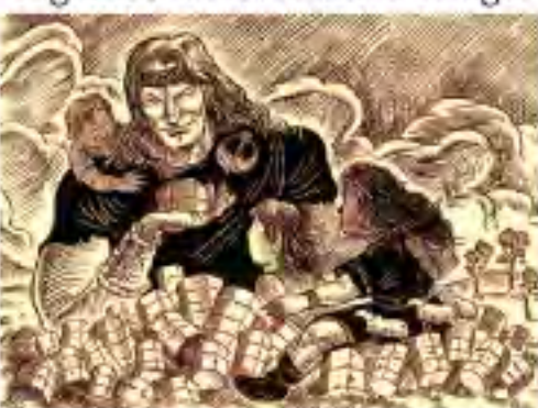
NO IRISH SPOKEN AT THE GIANT'S CAUSEWAY. No room for Ulster Scots or Scots Gaelic languages either. Why?