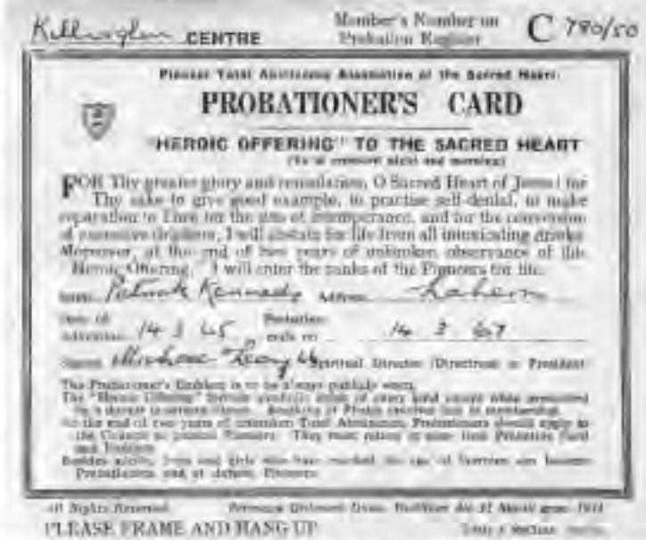
A pledge of total abstinence card