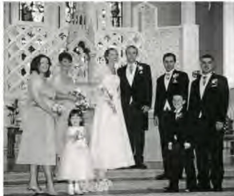
The Bridal Party at The Cathedral of the Assumption of Mary, Carlow