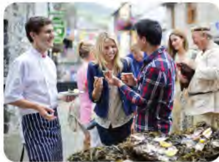
Carlingford Oyster Festival

going back hundreds of years. And now we are scattered all over the globe, 38 million in the US alone—an enormous number when you compare it to the pop-